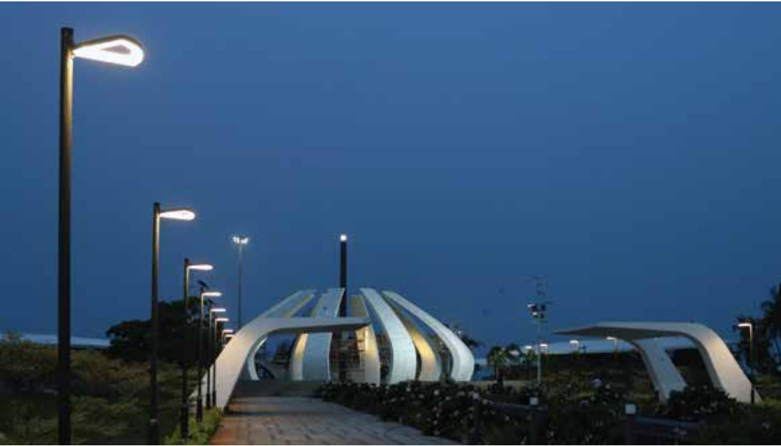
DR.J.JAYALALITHAA MEMORIAL, CHENNAI