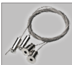
Suspension Kit - Optional