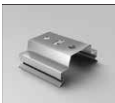
Ceiling Mount - Clip