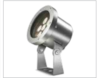
LED Fountain Light