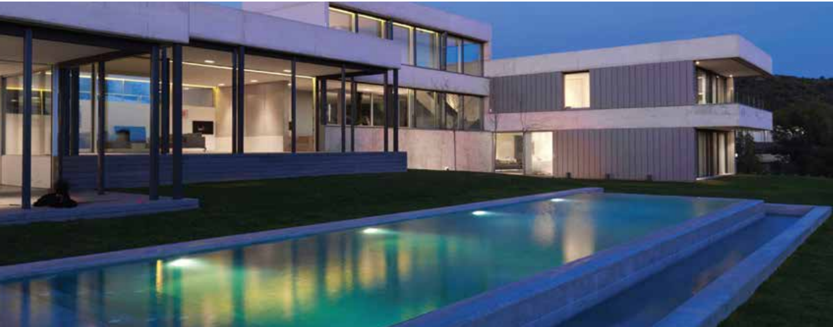
Recessed Pool LED Luminaires