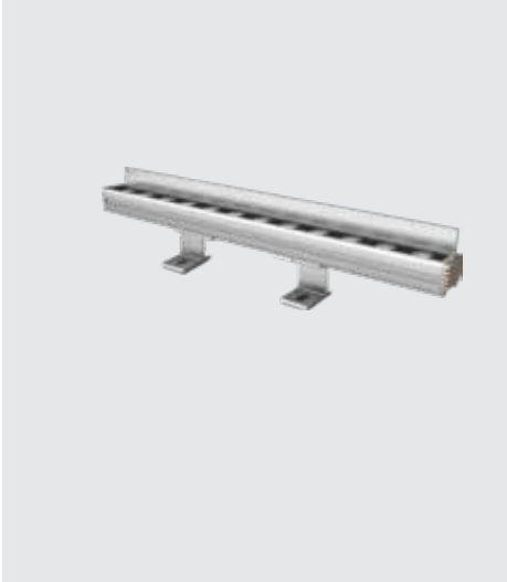
TAJ WELLNESS, GANDHI NAGAR