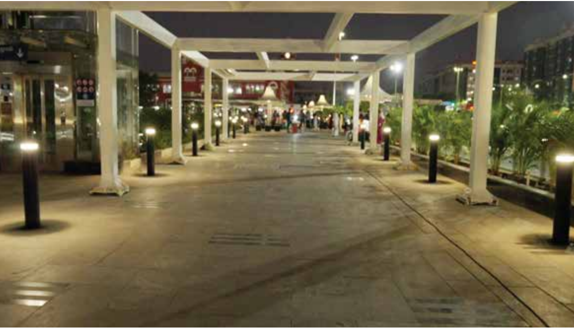
MGR CENTRAL STATION ARENA, CHENNAI